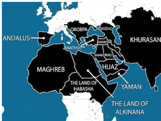
ISIS releases map of 5-year plan to spread from Spain to China

ISIL primarily claimed territory in Syria and Iraq, subdividing each country into multiple provinces. Throughout the years 2014 and 2015, ISIS also announced that they plan to gain the territories of North Caucasus, Nigeria, Southern Afghanistan, and Yemen.